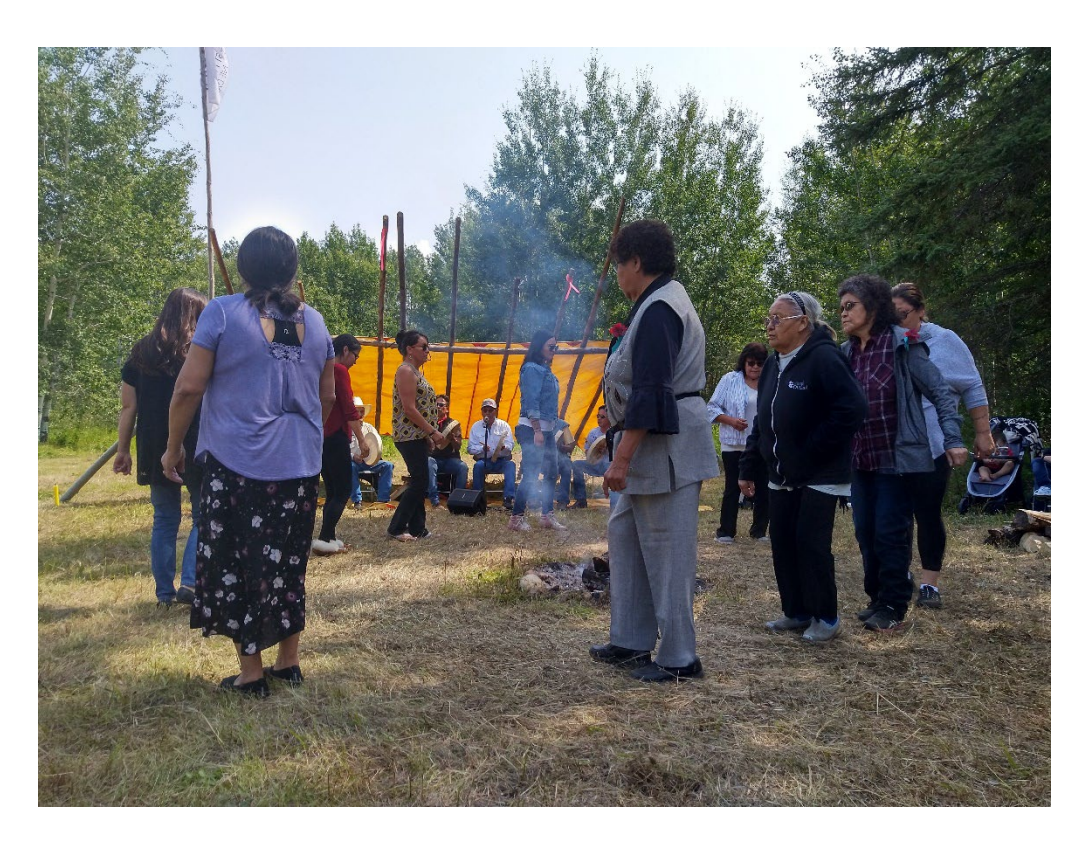
Tea Dance during a traditional funeral celebrated by Doig members at Petersen's crossing.

about rediscovering human-environment interactions, old subsistence practices, and allowing young people to get familiar with medical plants and bush food. Between July and September 2019, I spent three weeks working in the forest with Doig community members, clearing old trails while listening to old stories and rediscovering paths that ancestors used in the past for trading purposes, to hunt and trap. As I spent time with Doig members, I stopped asking questions about cumulative effects and development. Instead, I listened to the people, while spending time, and working with them. I learned about the dances and cultural practices in areas considered sacred as well as how the industrial development has compromised the community's ability to hunt and trap in their traditional territories. Through these experiences, I was able to understand the deep meaning of cumulative effects on people's lives.