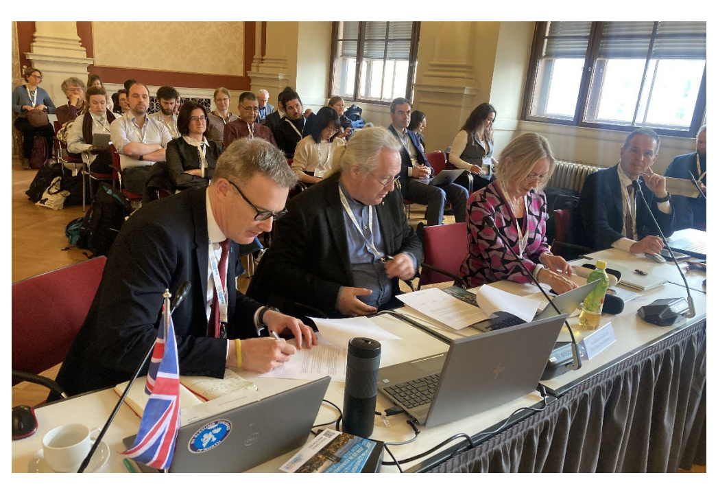
Signing the agreement with IASC in Vienna, February 2023

to meet and connect. As I write, the deadline for submitting session abstracts is approaching fast, but there will plenty of time to submit abstracts. We have published the planned timeline in this issue, and while some of the deadlines may be subject to change, it illustrates the plan for how we will organize the broad and genuine interest in our Arctic Congress Bodø 2024. The themes of the congress align with previous ICASSs and linked to Norway's Arctic Council Chairship's priorities in partnership with the Norwegian Ministry for Foreign Affairs. Our goal is that the congress in 2024 will result in new knowledge, showcase the strength of Arctic science, and spark new constellations of projects networks among scientists, educators, students, artists, and others with love for and interest in the Arctic.